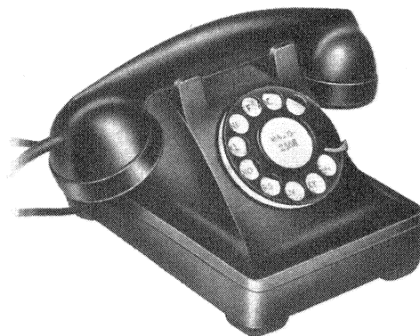
FIG. 1—309 TYPE